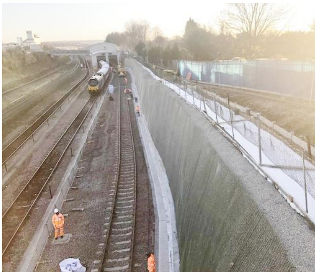
Finished retaining structure. The system using Deckdrain gained Network Rail engineer approval after trial

ABG provided design assistance and technical support during the design, trial and installation on this project.