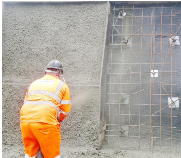
Installation trials demonstrated excellent adhesion of the sprayed concrete to Deckdrain

The contractor Shotcrete Services worked with ABG to develop a geosynthetic solution that would meet requirements, whilst providing the required drainage flow capacity and effective barrier to ensure long term performance. Following a successful trial, the BBA HAPAS certified ABG Deckdrain 700S/ST170 geocomposite drainage was approved. Deckdrain geocomposite, with its impermeable HDPE cusped drainage core, provided an excellent bond with shotcrete. The geocomposite was installed against the stabilised embankment, with spider fixings screwed onto soil nails. A393 mesh and 225mm thick C32/C40 steel fibre reinforced concrete wall was then sprayed to the bank. The Deckdrain installation was completed on time and drainage performance was reported to be adequate.