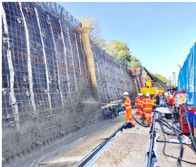
Deckdrain provides an impermeable skin for the drainage system, preventing ingress of concrete

Contact ABG today to discuss your project specific requirements and discover how ABG past experience and innovative products can help on your project.